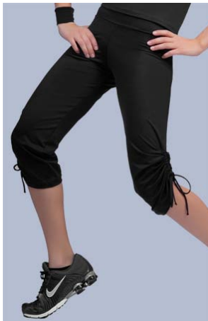
Crush Capri (available in red)