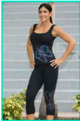
Monarch Top & Capri Cool Fitness Finds